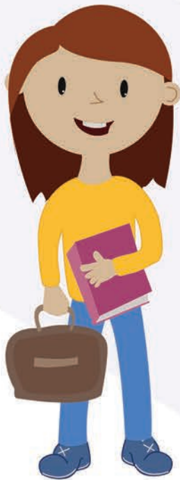
MIDDLE SCHOOL ages 11-13