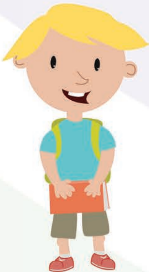
ELEMENTARY ages 5-10