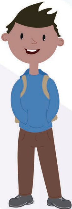
HIGH SCHOOL ages 14-18