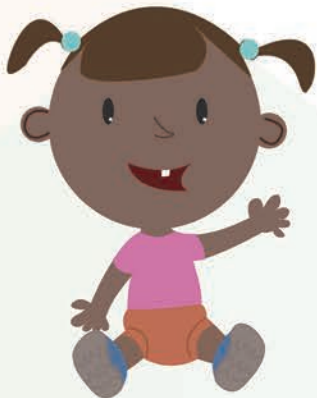
EARLY CHILDHOOD ages 0-4

Kids need to be in school. Research shows students who are chronically absent – missing just 2 days per month, or 10% of the school year – lose opportunities to succeed throughout their lives.