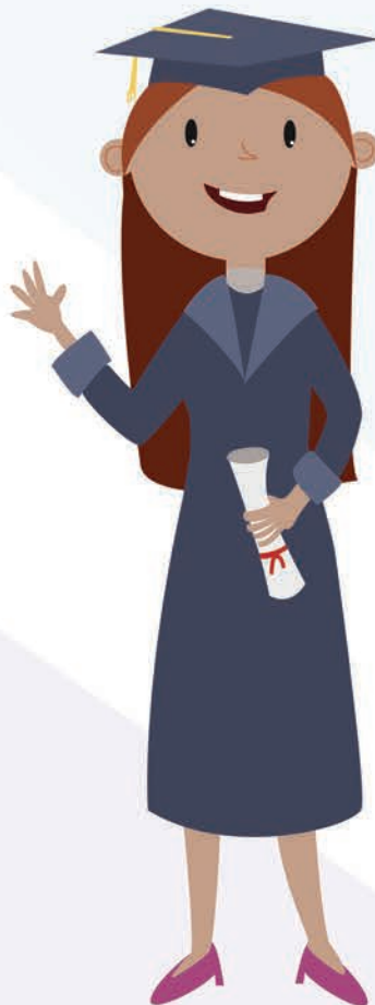
POST-SECONDARY ages 19 - 25