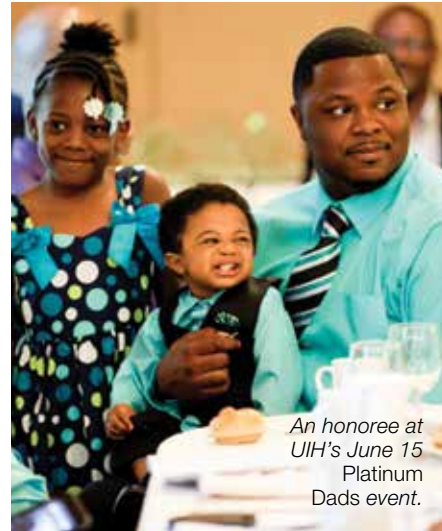
An honoree at UIH's June 15 Platinum Dads event.

UIH Family Partners is a nationally recognized pioneer in “helping fathers become dads” through education, counseling, job training, and placement assistance. Children of father-absent homes are twice as likely to abuse drugs and five times more likely to live in poverty when compared to their peers with involved fathers. UIH tackles this problem one father at a time, creating a culture of respect for parents, like those honored annually as Platinum Dads. They turn no one away and work with other agencies to help men who may be unemployed, recently incarcerated, or otherwise struggling to achieve self-sufficiency. Learn more at uihfamilypartners.org .