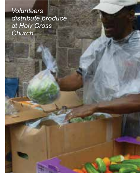
Volunteers distribute produce at Holy Cross Church

During growing season, FAH delivers 10,000 pounds of free produce every week to more than 2,500 Mercer County residents.